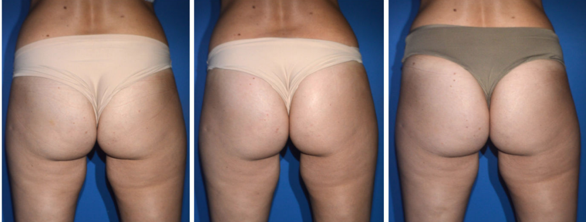
Figure 3: Photographs of a 25-year-old female (Subject ID 7) taken at baseline (left), after the 4th treatment (middle) and after 3 months (right).

photos is lifted, firmer and gives the impression of fuller look. In addition, a slight volumetric enhancement can be seen in the 3-month photograph.