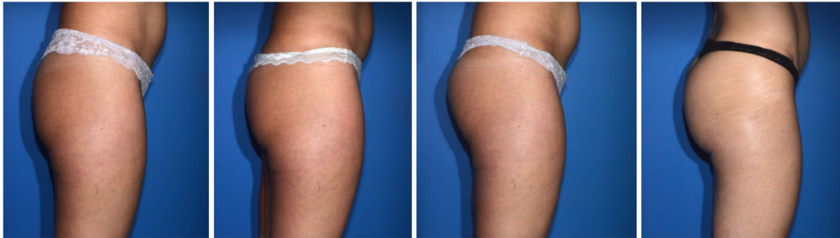
Figure 1: Digital photographs of subject ID 6 taken at baseline (left), after the 4th treatment (middle left), during the one-month follow-up (middle right) and three-month follow-up (right). The photographs illustrate gradual progress in the shape of the buttocks.